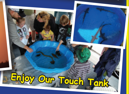
Enjoy Our Touch Tank