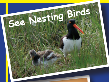
See Nesting Birds

SENIOR SPECIAL SAT. 10 AM • MON. 1:30 PM 55+ $18